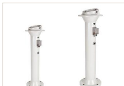
height 1300mm height 1450mm