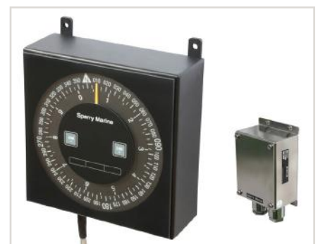
Bulkhead Repeater Compass 360°/10°