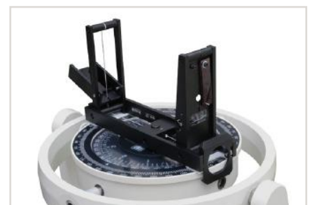
Prismatic Azimuth Device PV 23