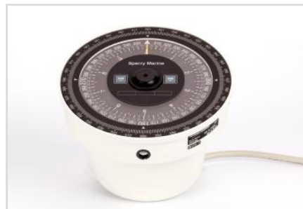
Bearing Repeater Compass 360°/10°