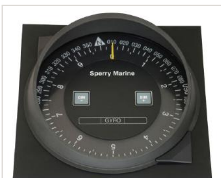
Console Repeater Compass 360°/10°