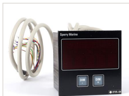
Digital Heading Repeater