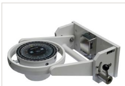
Bearing Repeater Compass 360°/10° w/ Adjustable Bearing Repeater Bracket