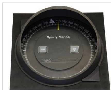
Magnetic Heading Console Repeater 360°