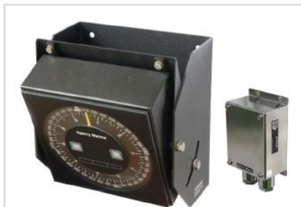
Bulkhead Repeater Compass 360°/10° w/ Wall Mounting Bracket