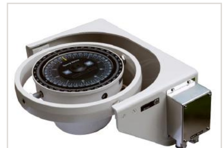
Bearing Repeater Compass 360°/10° with bearing repeater bracket