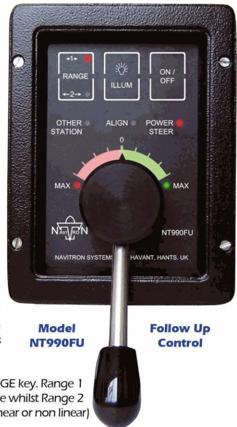
Model NT990FU Follow Up Control

When the NT990FU is engaged (ON) and the vessel is power steered to a new heading by this means, the autopilot course setter card 'tracks' ships head. On attainment of the new heading required, the NT990FU key can be set to OFF at which time the course setter card automatically 'locks' and the autopilot immediately resumes control to maintain the vessel on the new (current) heading.